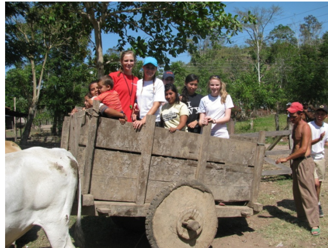
Traveling Nica style

Leadership Group joined the Carrollton team; it was great to see the interaction and bonding that took place. The young people learned a lot from each other and many are continuing their friendship via emails and Facebook.