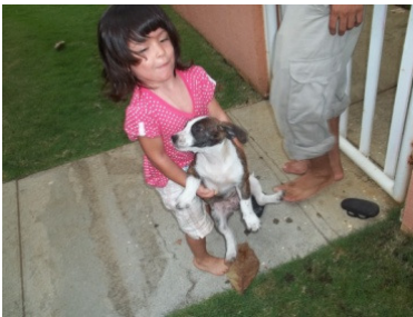
The neighbor's dog regrets he came to visit

We have entered the month of June and the rains have finally started. The heat has not abated but we are glad to have the dust settle. As we used to do at the camp, when the rain starts, someone yells lluvia and we all run out to bring the laundry in. Getting it dry these days is sometimes a challenge. We continue with our various projects and are thankful for the work God has given us and for your partnership with us which makes it all possible. You are an important part of this ministry, whether it is through your prayers, letters of encouragement or financial support.