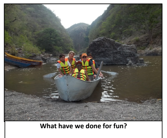
Traveling down the Somoto Canyon

Needs List Used laptop computers Hats T-shirts, any color Please contact us for information on where to ship these items.